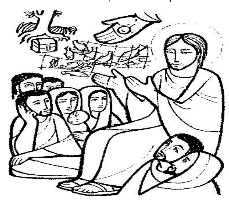
The Treasure we have found